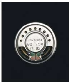
Icom custom high power handling capacity speaker