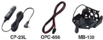
CP-23L OPC-656 MB-130

CP-23L: Vehicle charger cable for use with the BC-213. OPC-656: DC power cable for use with the BC-214. MB-130: Charger bracket for use with the BC-213.