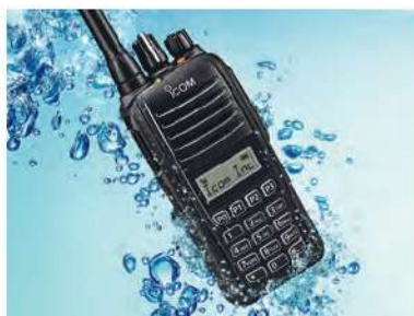
Waterproof for 30 minutes in one meter depth of water