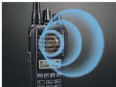
1500 mW powerful audio