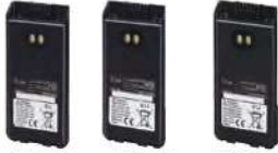
BP-278 BP-279 BP-280

BP-278: 1190 mAh (typ.), 1130 mAh (min.) rechargeable Li-ion battery. BP-279: 1570 mAh (typ.), 1485 mAh (min.) rechargeable Li-ion battery. BP-280: 2400 mAh (typ.), 2280 mAh (min.) rechargeable Li-ion battery.