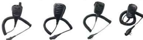
HM-171GPW HM-168LWP HM-159LA HM-158LA

HM-171GPW: GPS speaker microphone with a waterproof connector. IP67 protection. HM-168LWP: Waterproof speaker microphone with a waterproof connector. IP67 protection. HM-159LA: Speaker microphone with a 3.5 mm earphone jack. HM-158LA: Compact speaker microphone with a 3.5 mm earphone jack.