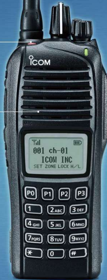
IC-F3263DT (Full keypad)