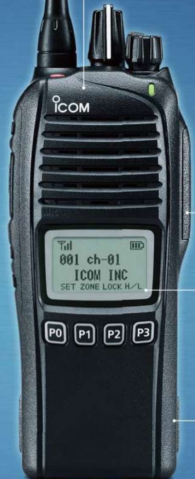
IC-F4263DS (Simple keypad)